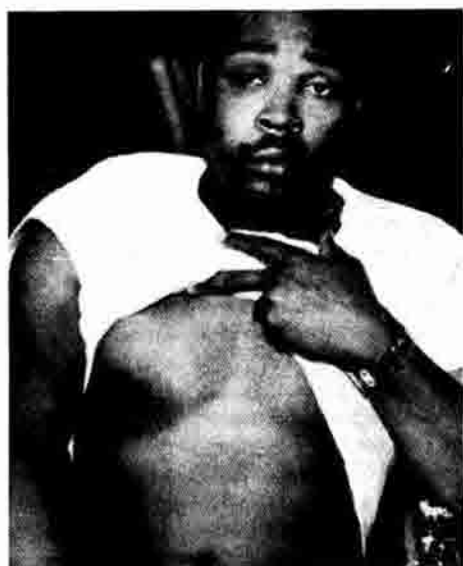
Rodney King after police beating

A local official said this evidence was not presented in the state trial because the prosecution didn't know about it. He didn't say why they didn't know.