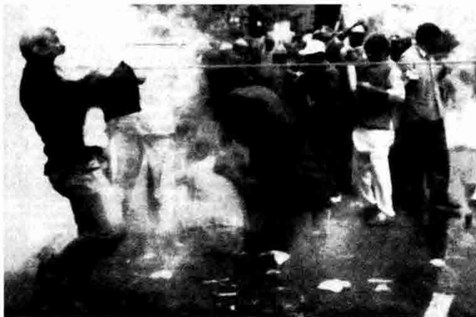
BJP member of parliament throws tear-gas shell back at cops in New Delhi protest