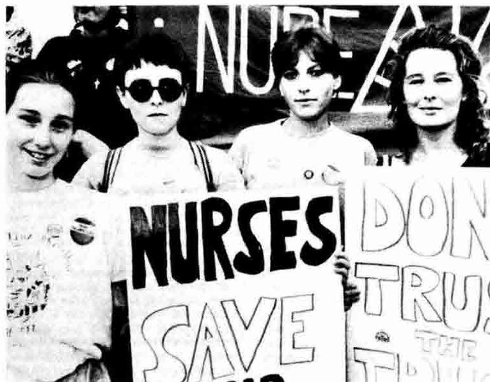
London hospital workers demonstrate in August 1992 against cuts in services. Major's government plans more cuts in health, social security, and education.

Discontent with declining economic conditions and increasing hardship and uncertainty for growing numbers of working people has been reflected in a public debate on the future of the monarchy in Britain. As a result, steps have been taken to reform aspects of this massively state-funded institution to make it more acceptable to workers. For the first time, for example, the queen will be subject to income tax on her private income.