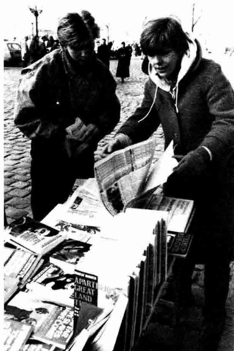
Demonstrator at January 30 rally in Berlin against anti-immigrant violence checks out the Militant .