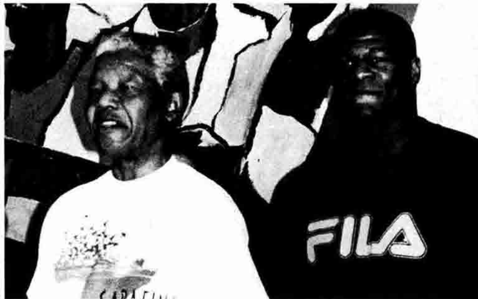
Scenes from ANC international solidarity conference held in Johannesburg February 19-21. Top and bottom left: conference participants. Top right: ANC national chairperson Oliver Tambo. Bottom right: Nelson Mandela with world heavyweight boxing champion Riddick Bowe, one of special conference guests.