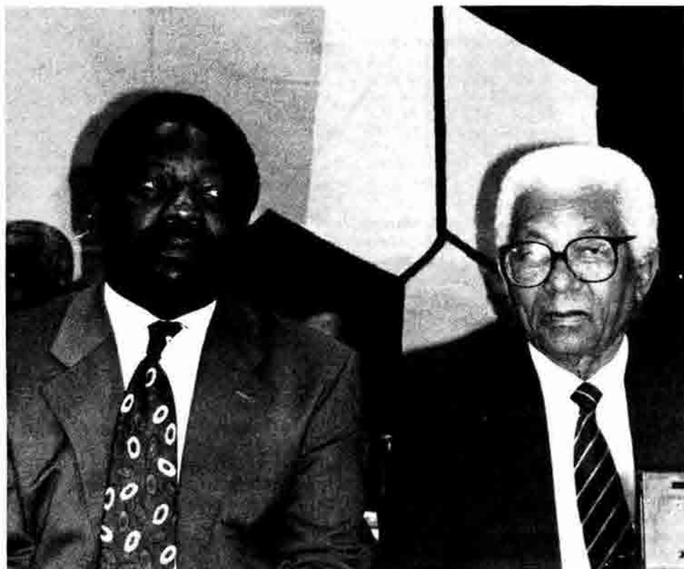
ANC leaders Cyril Ramaphosa (left) and Walter Sisulu

Ramaphosa told the students, the ANC is playing a "role no other party or organization can lay claim to."