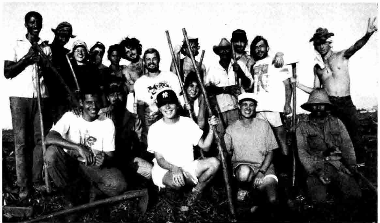
Members of international brigade at camp near Havana, Cuba, came from five countries in the Americas.