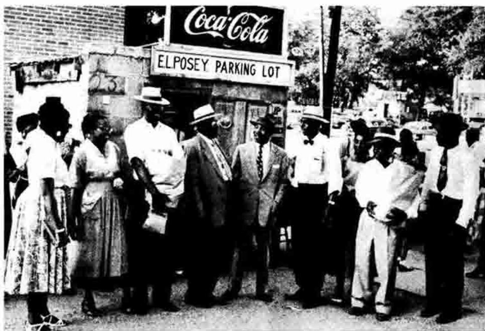
Struggles by tens of thousands of working people were force that overthrew segregation. Above, Blacks in Montgomery, Alabama, wait to car pool during the Montgomery bus boycott of 1955-56. Martin Luther King is in center.

There were many figures in the civil rights movement and many different views expressed. Some participants, like NAACP lawyer Marshall, became nervous as it became a mass movement in the streets. Marshall was suspicious of the militant youthful wing of the movement as