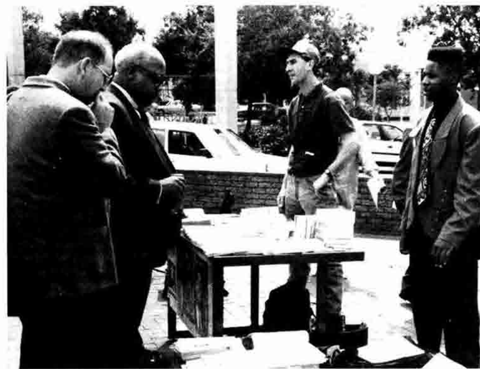
Pathfinder literature table at ANC solidarity conference in Johannesburg

Collections of Nelson Mandela's speeches were hot items. Ten of these were sold. Also in demand were speeches and writings by Thomas Sankara, the leader of the revolution-