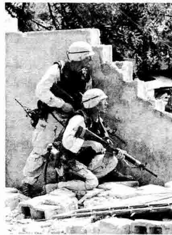
U.S. soldiers in Mogadishu

Why is Washington invading Somalia? — page 11