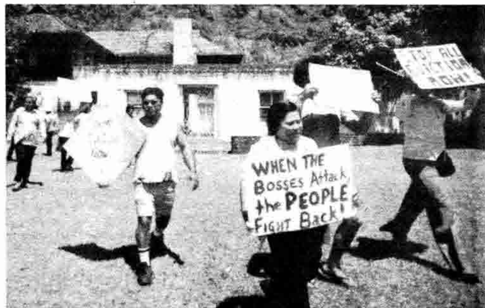
Housing protest in Hawaii, 1980. Two million acres of land were expropriated from indigenous Hawaiians in 1893. Discussion on opposing discrimination is on rise today.

Mililani Trask, a prominent political activist, calls for a "nation within a nation," similar to those recognized through existing U.S. treaties with 300 American Indian nations. Her organization, Ka Lahui Hawaii (the Hawaiian Nation), seeks recognition by the U.S. government as a self-governing entity within the state of Hawaii.