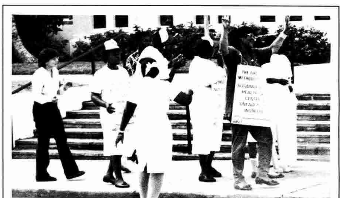
Fifty striking certified nursing aides picketing church that owns their workplace, Susanna Wesley Health Care Center located in Hialeah, Florida. The mostly Haitian women won union recognition and a pay raise October 6 after walking out a week earlier.

wearing purple ribbons for the 47 people, including 5 coworkers, who died in the September 22 train wreck in Alabama.