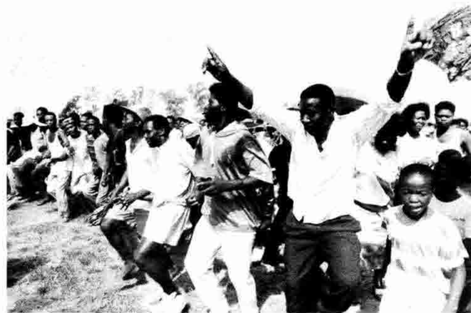
Rally greeting Nelson Mandela in Wembezi, Natal Midlands, March 12, 1993.

We invite the business people to get ready to return. Those who have sanctions legislation on their statute books and those institutions which correctly remain bound by