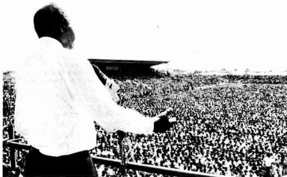
Mandela addressing rally in Port Elizabeth, South Africa, in 1992. “We must succeed... in the interest of all who value freedom and human dignity,” he told NAACP convention.

I am very glad that I have at last been able to be with you in person, to thank you for the honor you bestowed on us when you linked us to a real hero by awarding me the W. E. B. Du Bois Medal in 1986. We heard