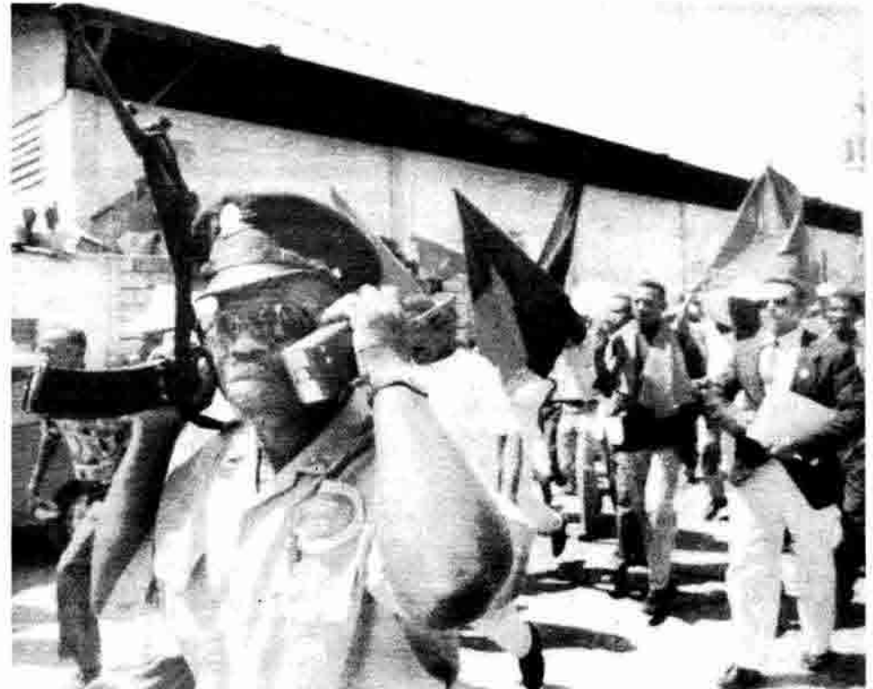
Policeman in Port-au-Prince leading march against Aristide's return. Washington is responsible for setting up Haiti's repressive military force in the first place. The Pentagon is now planning to send hundreds of troops supposedly to "retrain" these same thugs.

On October 11, a crowd of about 100 people gathered, with open police support, by the harbor in the capital city of Port-au-Prince, to