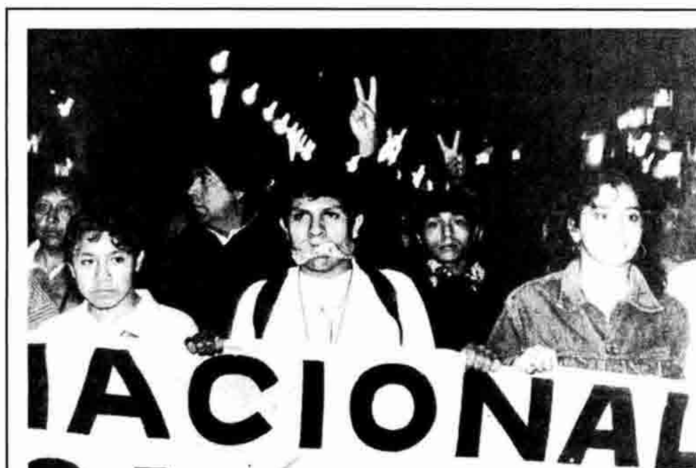
Thousands of students marched in Mexico City September 24 to commemorate the dozens, perhaps hundreds, of youths killed by the army at a protest 25 years ago. Demonstrators called for the release of government files on the shooting. The demands that fueled the 1960s student movement, drawing as many as 350,000 people to rallies, included greater university autonomy and freedom for political prisoners.

Cuba's five eastern provinces will reportedly create their own organization for trade with countries in the Caribbean. Trade is currently centralized in Havana. Leaders of the 13-member Caribbean Community approved a joint technical cooperation commission with Cuba at their July summit. Havana's nonpetroleum trade with Caribbean countries has increased from $8.6 million in