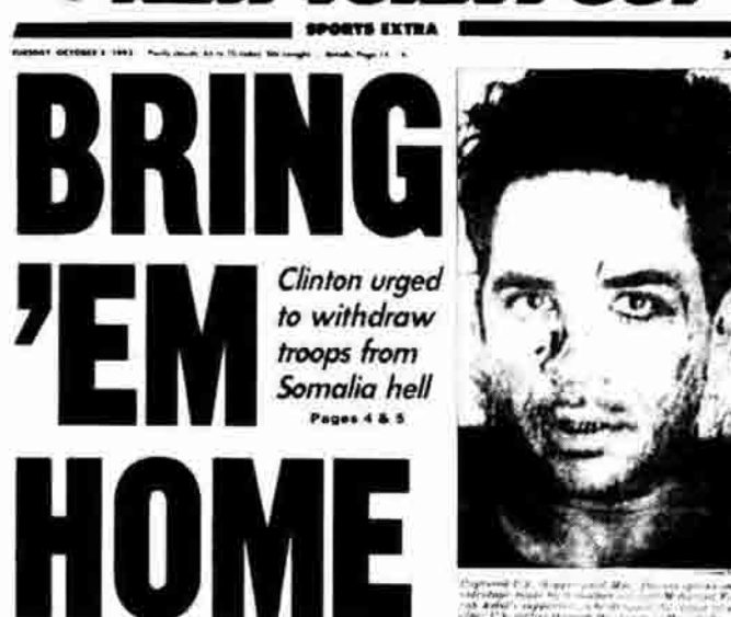
Front page of October 5 New York Post epitomized right-wing calls for troop withdrawal from Somalia. While putting forward what sound like antiwar slogans, spokespeople for U.S. imperialism argue for a more effective policy to defend the interests abroad of the wealthy ruling families.

population of 7 million and a per capita gross national product of $120 a year.