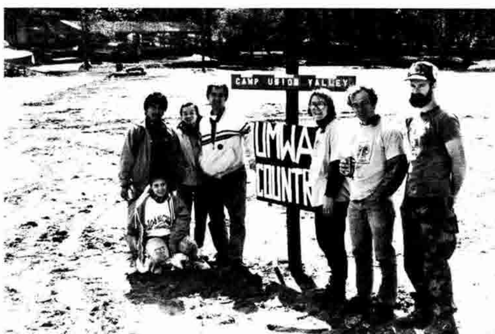
Members of International Ladies' Garment Workers' Union solidarity delegation with UMWA striker at Camp Union Valley in Pennsylvania. Camp Union Valley officially opens October 16. It is designed to serve as a solidarity and information center for the 18,000 miners on strike in seven states.

The garment workers visited Camp Union Valley, near the town of East Finley, Pennsylvania. The camp is four miles down the road from the big nonunion Bailey mine, which belongs to Consol Energy Inc. Consol and the other coal companies have violated the clause