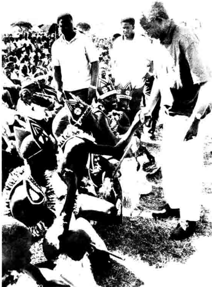
Nelson Mandela congratulates members of Zulu dance group during his tour of Natal Midlands following violence in March.

But in the course of these negotiations, we have said: We want an elected and sovereign constituent assembly. The govern-