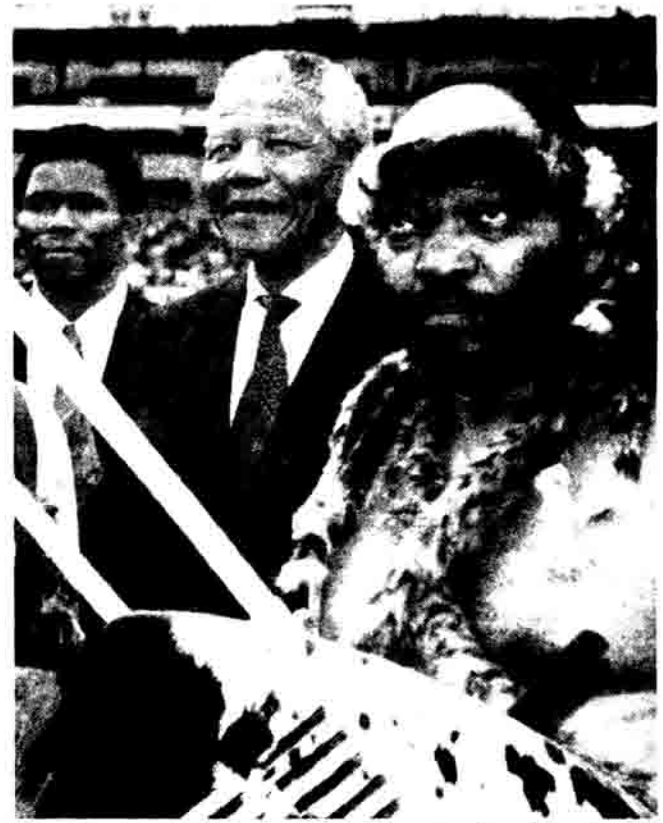
Mandela (center) at campaign rally in Durban October 24. On the right is ANC official Jacob Zuma, who is Zulu.

Former South African Army general Constand Viljoen, who leads the AVF, is also demanding recognition of self-determination and a national state for white Afrikaners.