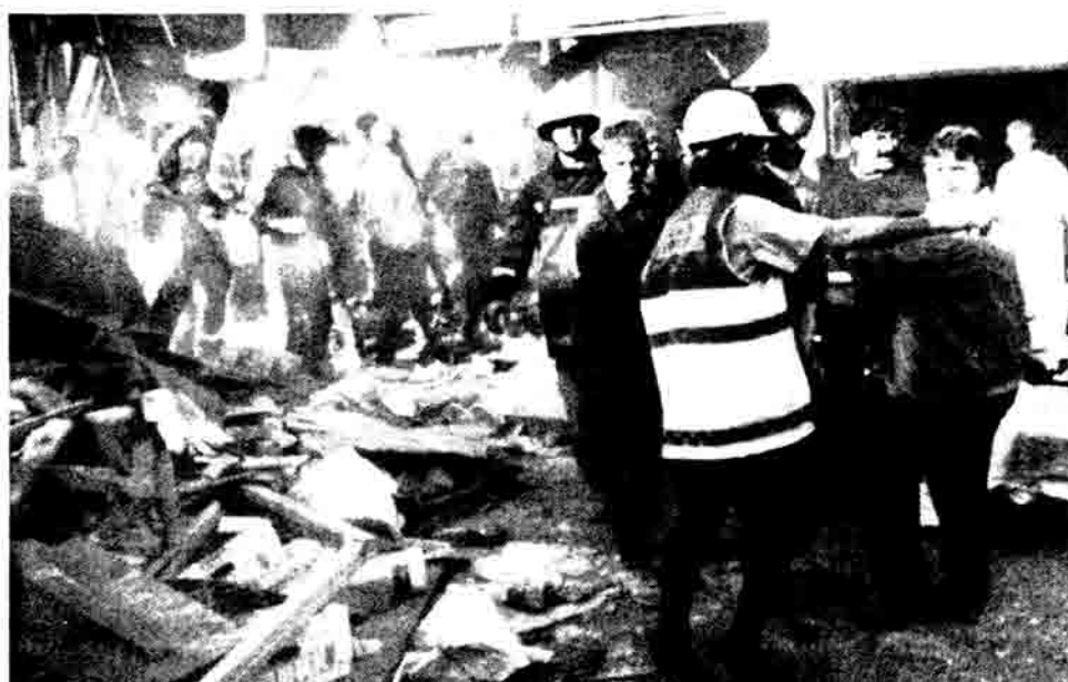
Rescue workers remove body from rubble after blast in Belfast that killed 10 people.

"There can be no question of talking to any people or organizations who are capable