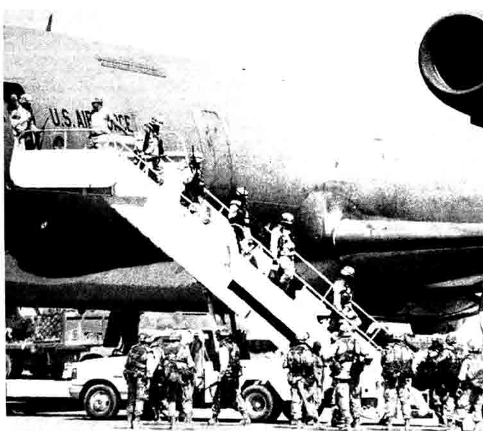
U.S. Army soldiers from 24th Infantry Division from Fort Stewart, Georgia, land in Mogadishu, Somalia, as part of Clinton's plan to build up U.S. troop strength there.

A French court rejected Paul Touvier's final appeal and ordered him to stand trial for crimes against humanity. He is the first French citizen to be tried on these charges.