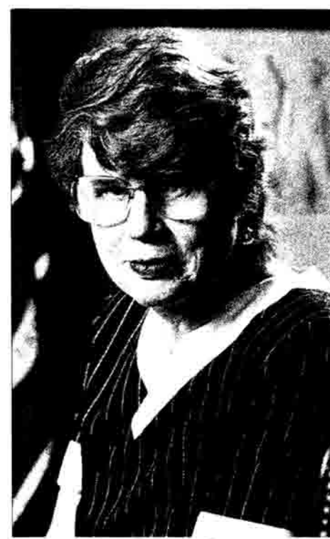
Attorney General Janet Reno

The more conservative New York Post also took its distance from Reno's plan. "This kind of regulation is a step along the way to full-fledged government control of broadcasting content," warned the Post . "It would signal a not-insignificant step towards control of information by the federal government."