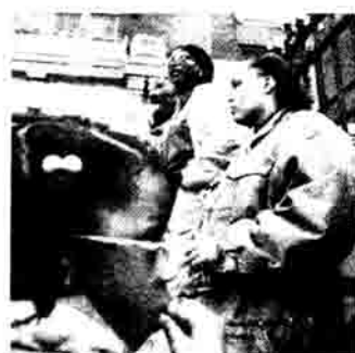
Parents and schoolchildren protest outside Public School 156 in Brooklyn, New York, to demand permanent building for students displaced because of asbestos crisis.

The 'Wall Street Journal,' the 'New York Post,' and other big-business dailies, as well as many capitalist politicians, are campaigning for 'school choice' in the latest attempt to undermine public education. Will so-called school vouchers and privatization of schools solve the mounting problems facing millions of students? The 'Militant' provides facts and analysis you can't find anywhere else. Don't miss a single issue!