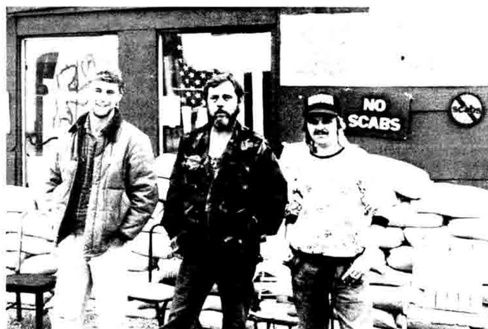
Striking Indiana miners in front of picket shack. UMWA members had to fortify the structure after shots were fired at it from nearby company complex.

Since the strike began, federal mine officials have cited the company for numerous