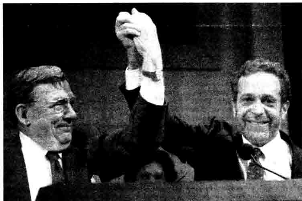
AFL-CIO president Lane Kirkland (left) clapping hands with U.S. secretary of labor Robert Reich. Labor officials are Clinton's "most reliable troops," said Kirkland. AFL-CIO officials advanced a perspective of tying workers' fortunes to employers' profitability instead of projecting a fight to defend the working class and its allies from effects of capitalist economic depression. Coal miners' strike received scant attention at the California convention.

U.S. attorney general Janet Reno, who ordered, with Clinton's approval, the April