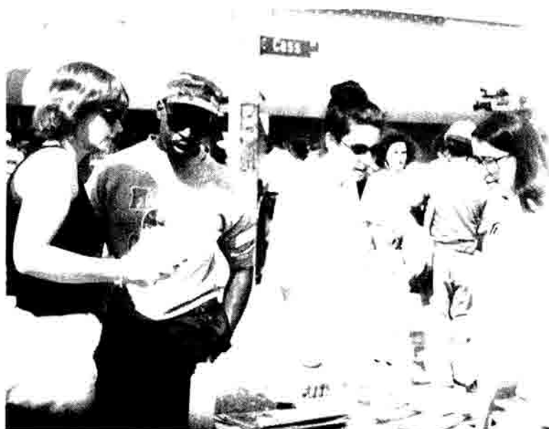
Selling the Militant at Tampa, Florida, march against hate and violence October 24.

The results? Sixteen Militant subscriptions, one PM subscription, and two copies of New International no. 7 with the article "The Opening Guns of World War III: Washington's Assault on Iraq."