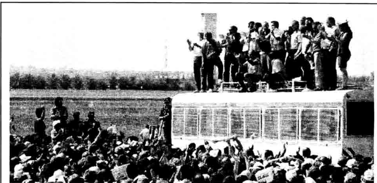
Five to six thousand striking aerospace workers fanned out across runways at Tel Aviv's Ben-Gurion International Airport, above, closing it for three hours October 21. Workers are fighting plans to eliminate 4,000 jobs and cut wages 15 percent at government-owned Israeli Aircraft Industries.