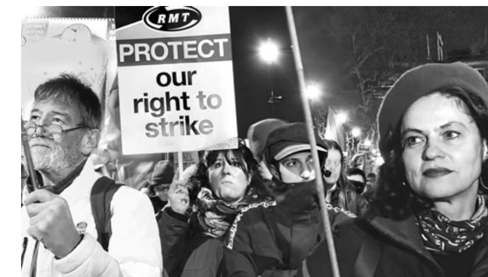
Hundreds of trade unionists join protest against government anti-strike bill Jan. 16, Downing Street, London. Action was called by the Rail, Maritime and Transport union.