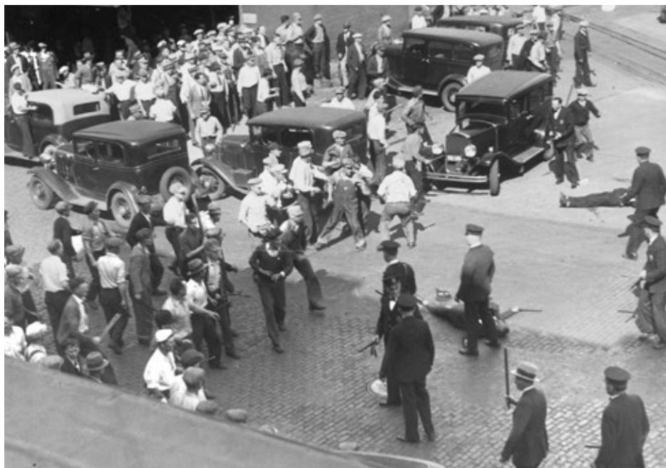
Minneapolis Teamsters defeat attacks by police, bosses' thugs in "Battle of Deputies Run," May 21, 1934. Class-struggle leadership mobilized union, support, ensuring strike was victorious.

The Communist League of America 1932-34 by James P. Cannon is one of Pathfinder's January Books of the Month. Under the inspiration of the 1917 Bolshevik Revolution in Russia, Cannon helped found the Communist Party in the U.S. in 1919. He was a central leader of the Communist League of America founded in 1928 and the Socialist Workers Party a decade later. He led the international movement spearheaded by Leon Trotsky fighting to continue the proletarian internationalist course of V.I. Lenin after a bureaucratic counterrevolution was carried out under Joseph Stalin in the Soviet Union and Communist International. This 1934 excerpt is from "Minneapolis and Its Meaning," on the historic battle won there by Teamster unionists. Copyright © 1985 by Pathfinder Press. Reprinted by permission.