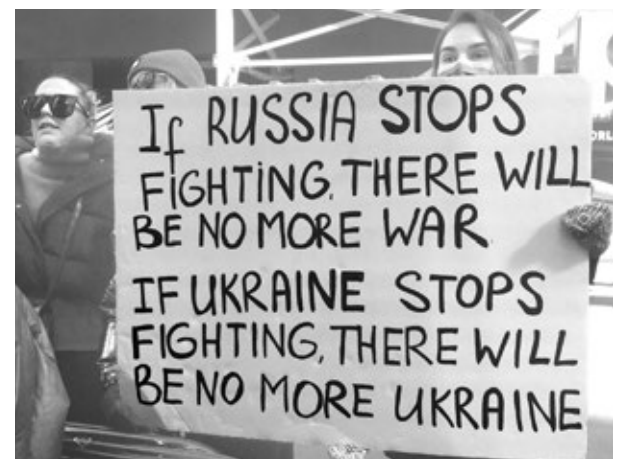
Ukraine protest in New York Times Square Feb. 26, 2022.