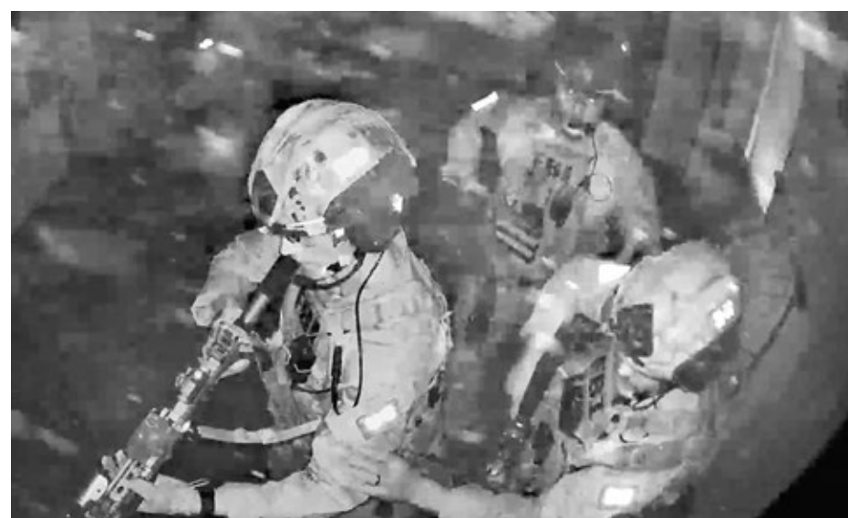
FBI commandos break into offices of African People's Socialist Party in St. Louis in July 2022 (above) and in St. Petersburg, Florida — just a week before raiding Donald Trump's Florida estate — alleging leaders of the group were "agents" of Moscow. Defending and extending freedoms protected by the U.S. Constitution is at the center of the class struggle today.

and the leading cadres of the Rebel Army. And to the SWP's class-struggle experience from the founding of the first communist party in the US in 1919 down to today.