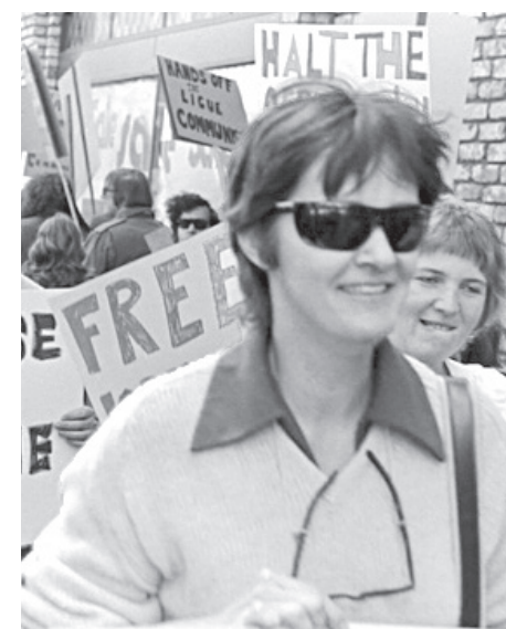
Montauk in 1968 Bay Area protest against jailing of members of sister party in France.

For further information about the meeting, contact (510) 686-1351 or email swpoak@sbcglobal.net.