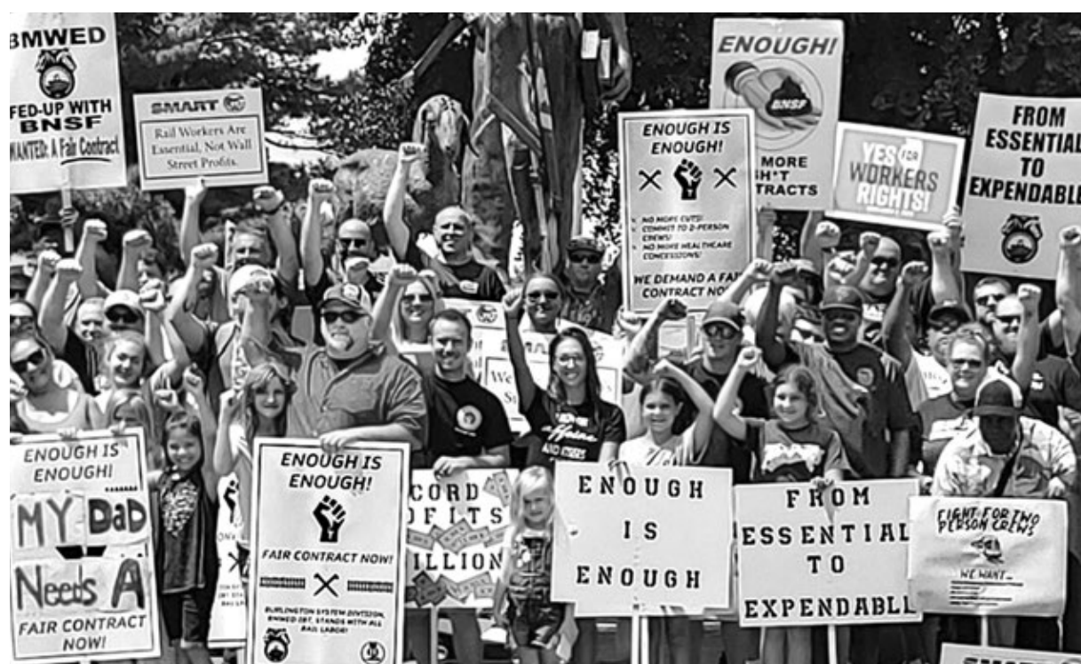
Rail workers rally July 2022 in Galesburg, Illinois, against carrier bosses' refusal to address inhumane work schedules, working conditions, and crew sizes. President Joseph Biden and bipartisan Congress barred right to strike.

See page 8 for distributors or visit pathfinderpress.com