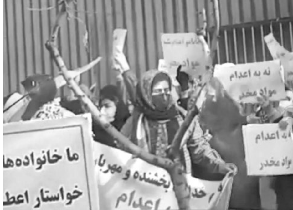
At Tehran court Jan. 16 families of those facing execution on drug charges, part of wider protests across Iran against death penalty, chanted, "Let authorities answer! No to executions!"

Protests: 'No death penalty! Free political prisoners!'