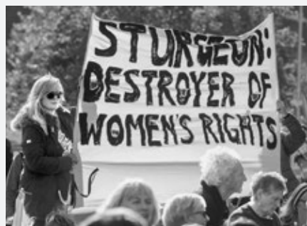
Demonstration in support of women’s rights at Scottish Parliament in Edinburgh Oct. 6

Hundreds protested outside the Scottish Parliament Dec. 21 against bill that claims one’s gender can be changed at will, which undercuts the fight for women’s rights. The ‘Militant’ explains that unity of working people is strengthened by gains for women.