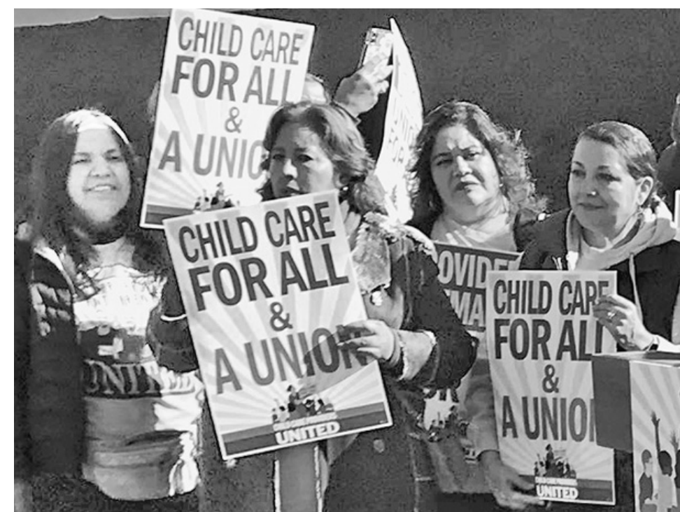
There's no road to Black freedom or women's emancipation separate from struggle to confront capitalist social crisis bearing down on working people and our families. Above, child care providers turn in signatures in Sacramento, California, February 2020 in fight for union recognition.

power, historical materialism, and basic physical and biological science — against what the resolution calls the "anti-working-class race-baiting, wokery, and 'cancel culture' on the bourgeois and petty bourgeois left."