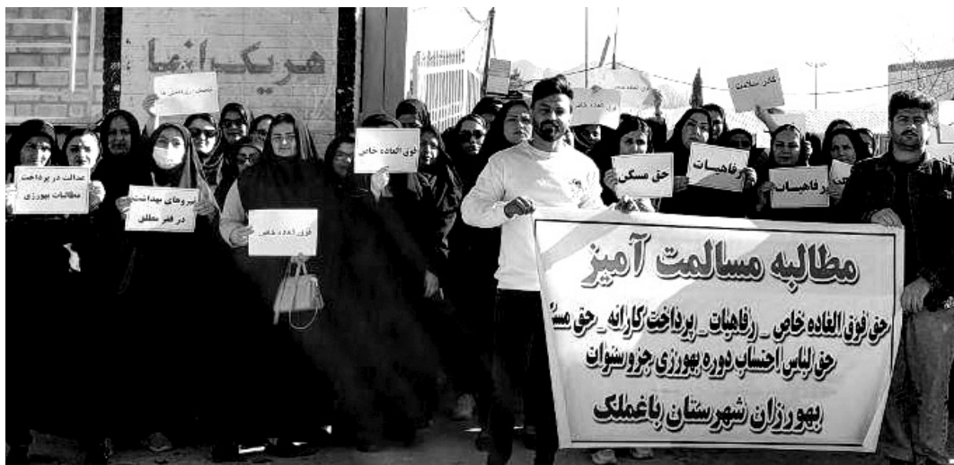
Coordinating Council of Nurses' Protests

Health care workers in Khuzestan province, Iran, March 13, demanded higher wages, pensions and benefits. Truckers in recent nationwide strike, other workers, have rejected regime's calls to sacrifice and subordinate their demands in name of supporting Hamas and "Death to Israel."